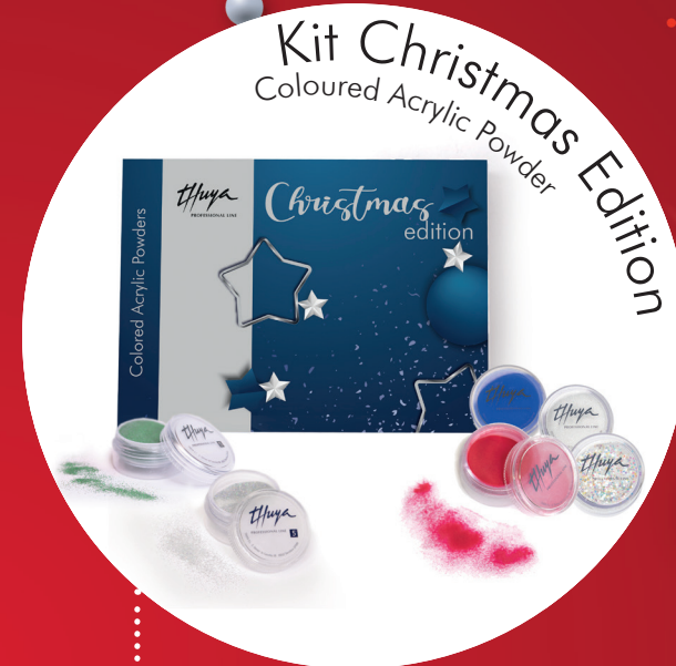
Get amazing manicures with the best selection of coloured porcelains for the Christmas holidays. ref. 011502096