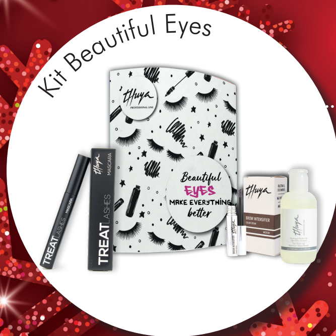
Gift box for a perfect look. Contains: - Curcuma Make-up Remover 100 ml - Brow intensifier Medium - Treat Lashes Mascara - GIFT ref. 011106035