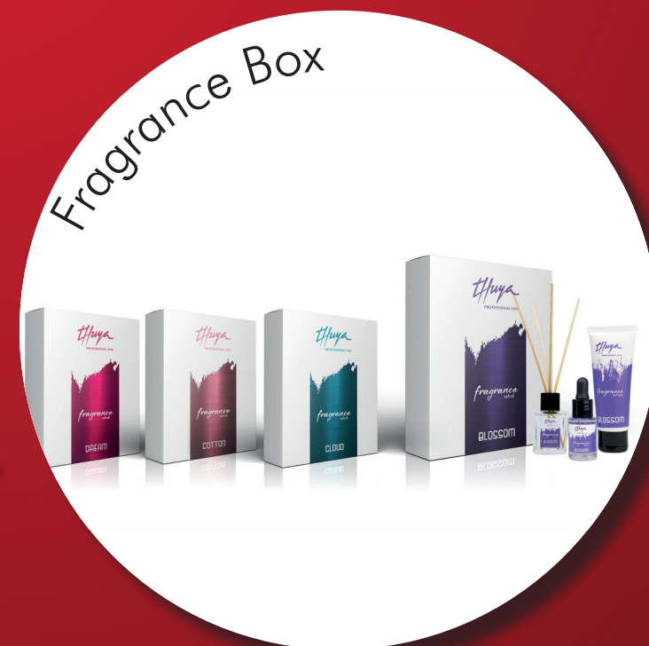
Fragrance Gift Boxes ideal for gifts, take care of your hands and fill your home with a pleasant perfume. Contains: - Hands Cream 75 ml - Nails Oil - Mikado fragrance. BLOSSOM ref. 012000413 CLOUD ref. 011208258 COTTON ref. 011208257 DREAM ref. 011208256