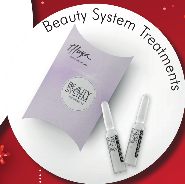
Box with two Beauty System ampoules, perfect for your clients to take care of themselves. ref. 011208259